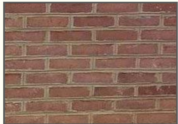
Buff Mortar Joint